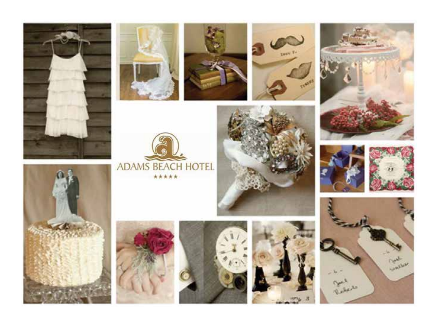
Adams Beach Hotel