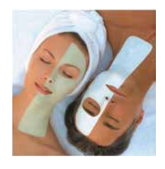
His & Hers:

30 min Sauna: 30 min Back/Leg Massage x2 30 min Indian Head Massage x2